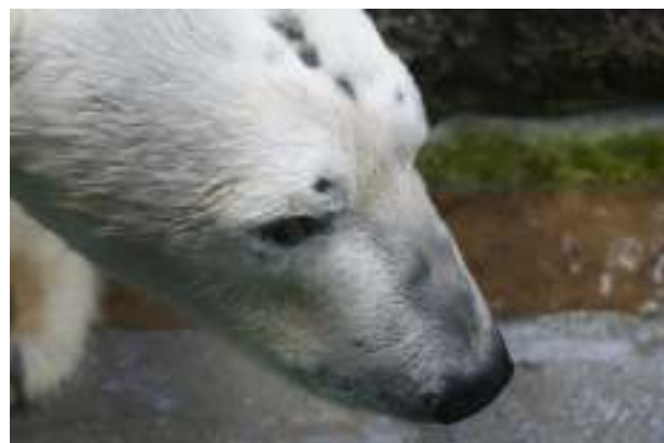
Enclosure 1: The larger bear had bald patches on his head.

Enclosure 1: The larger bear had bald patches on his head and shoulder. A sign referring to the male bear Iwan (probably the larger bear) stated that “the black skin can be seen on the head because he has been active as usual.”