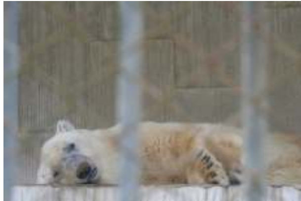
Many bears exhibited long periods of inactivity.

Many of the bears spent a large proportion of their time inactive. This is likely due in part to the extremely hot ambient temperatures that they were exposed to during the course of this investigation. However, the uninteresting living conditions and lack of stimulation was likely to be an important contributing factor too and excessive inactivity in zoo animals is also one of the recognized signs of chronic stress.