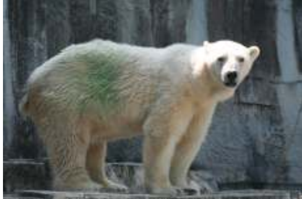
The bear in the main enclosure had algal growth in the guard hairs.

Enclosure 2: The bear was seen to display stereotypic behaviour (neck turning). The bear was also seen repeatedly bobbing up and down in the pool in a repetitive, stereotypic fashion.