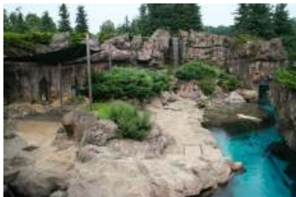
The main enclosure which was on view to the public.