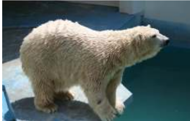
The smaller bear was considerably overweight.

There did not appear to be any obvious outwardly visible signs of physical abnormalities for the larger bear.