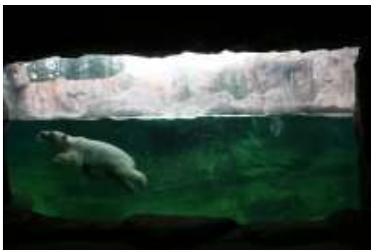
Underwater viewing window at Enclosure 1.

Enclosure 2: The smaller enclosure was open-air extremely small and roughly triangular in shape. It was at visitor level with high walls all around. There was 1 large glass window at the front of the enclosure through which visitors could look into the enclosure from a covered viewing area.