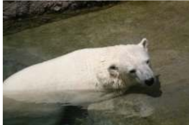
Enclosure 1: The smaller bear spent much of the day lying in the same position in the pool.

The smaller bear was inactive for most of the day, spending the majority of the time resting and sleeping in the pool. If the smaller bear was the female, there was an indication that she had been noted to be inactive before as a sign explained “She (Lulu) has been active since the beginning of the year,” suggesting that before this time she was more inactive.