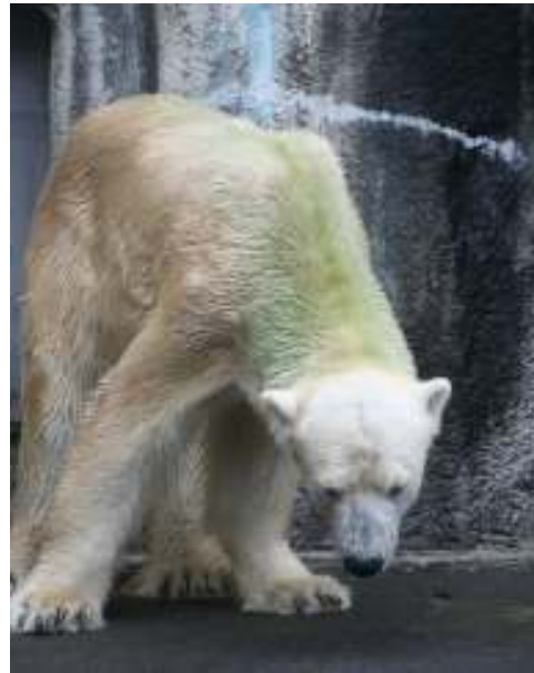
Many bears had green fur, caused by algal growth in the guard hairs. This signifies an inappropriate living environment.

The algae itself does not harm the bear; it is what the algae signifies that is the problem. In captive polar bears in the summer months, the habitat of the hollow hairs suit the algal cells well as it is warm and moist. 54 The rampant algal infestation of the fur of the polar bears is therefore a clear indication that their fur is warm and moist which strongly suggests their bodies are hot and also indicates that their fur is damp for substantial periods of time. The appearance of algae in the hair shaft is therefore indicative of an unsuitable living environment and is also likely to be partly caused by the fact that the bears have no soft substrates that they can use to dry off when they come out of the pools.