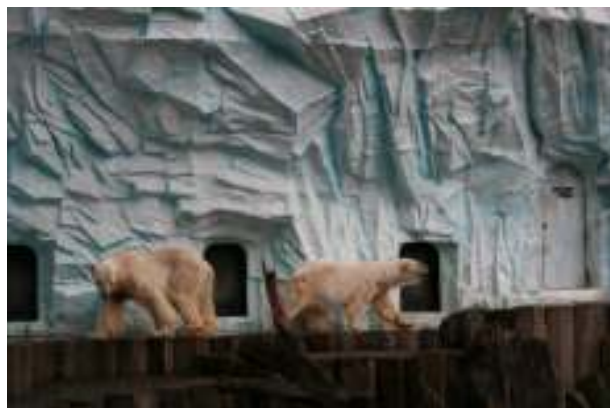
The bears paced the same route simultaneously at the top level of the enclosure.

Both bears utilized only a limited area of the enclosure. No interaction between the bears was observed.