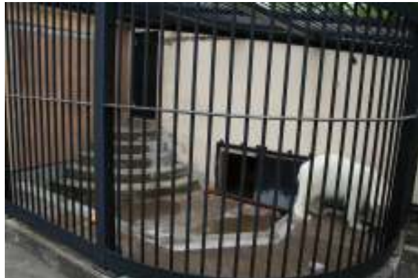
Some enclosures, like this one at Sapporo Muruyama Zoo, were extremely small.

One of the most obvious problems with the vast majority of the polar bear enclosures at Japanese captive facilities was the extremely small amount of space provided for the bears.