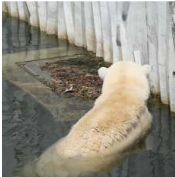
Some pools and moats contained unhygienic water, such as this one at Higashiyama Zoo.

The condition of the water was of particular concern at enclosures at Nihondaira Zoo, Higashiyama Zoo, Kyoto Zoo, Himeji City Zoo and Cuddly Dominion. In addition, the bears at Higashiyama Zoo also had access to a moat at the front of the enclosure which contained filthy, stagnant water. The bears were seen to swim in this water and drink it. There were also drains at the sides of this moat which were filled with rotting leaves and pieces of food. The bears were seen to eat this waste.