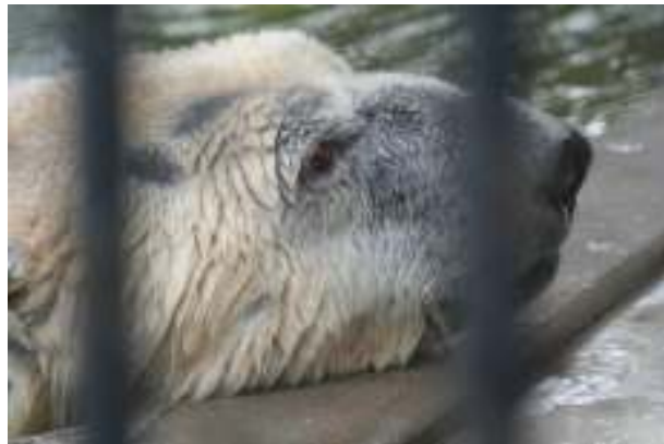
Paul had bald patches on his head.

Paul had bald patches on his head. A sign explained that Paul's teeth were worn down so he was not able to chew well, therefore his meat was minced for him.