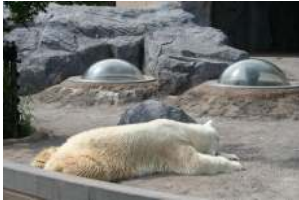
This bear was subjected to intense visitor viewing pressure.

Enclosure 2: No private areas for the bear to escape from public view. Visitors could stand all the way around the front of the enclosure and also at a viewing area at the back. In addition, there was a viewing window at the back of the enclosure. There were also 3 Perspex “viewing domes” inside the enclosure where visitors could put their heads up from below and look into the enclosure. Visitors could do this continuously, resulting in a complete invasion of the bear’s privacy.